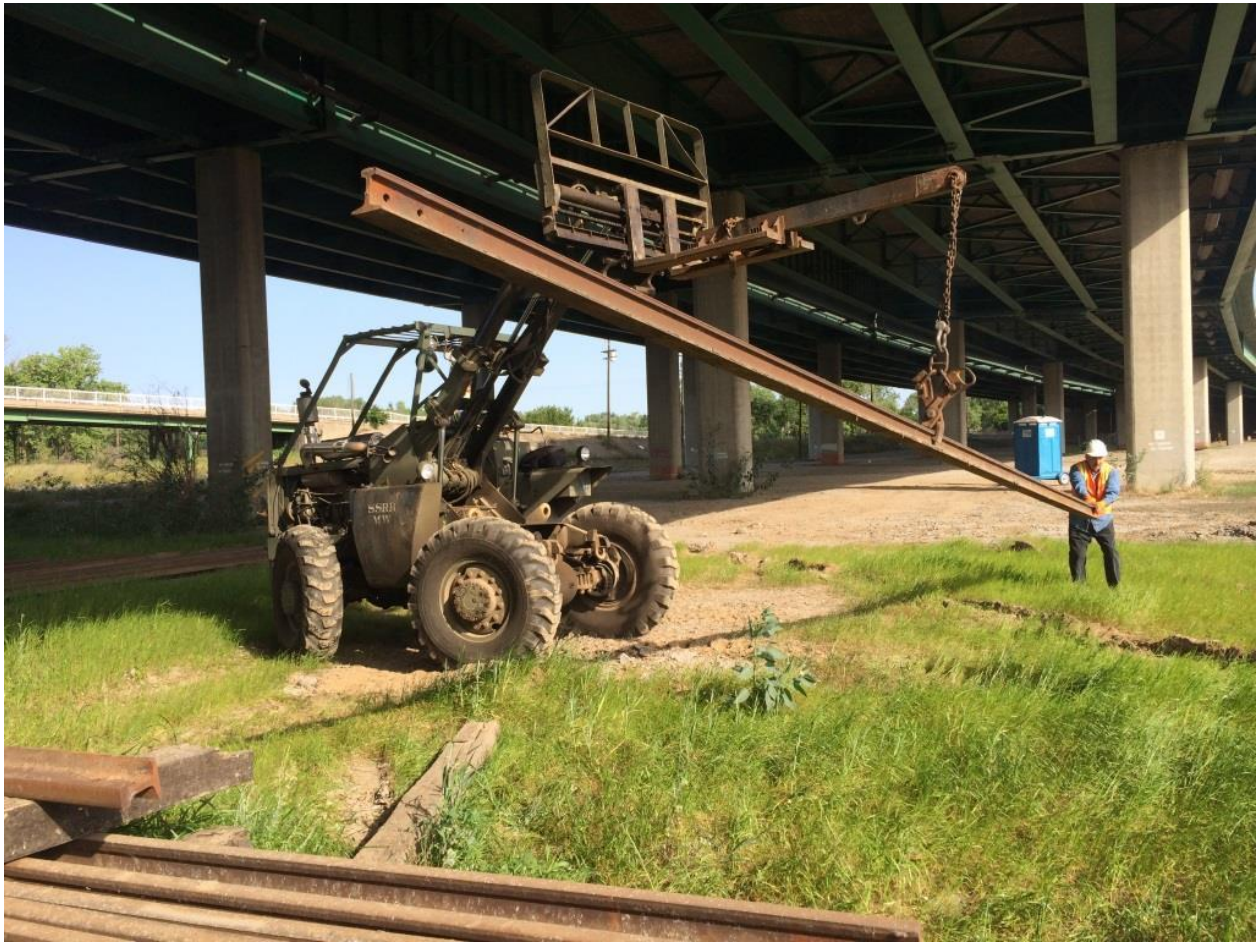
Fred stabilizes the half-ton stick of rail