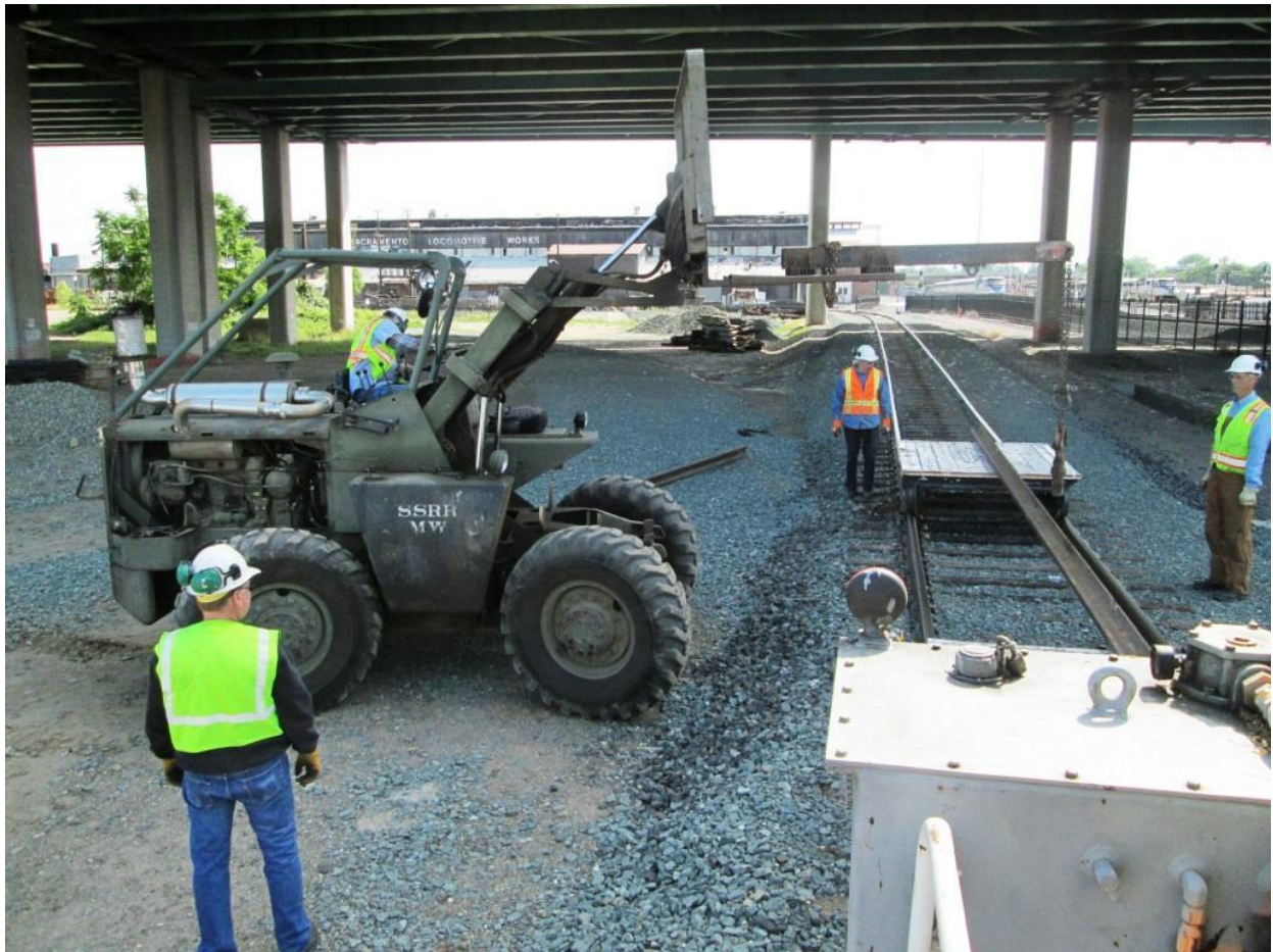
Steve on Big Green lowers the stick of rail onto the flat-cars for transport over to Old Sac.