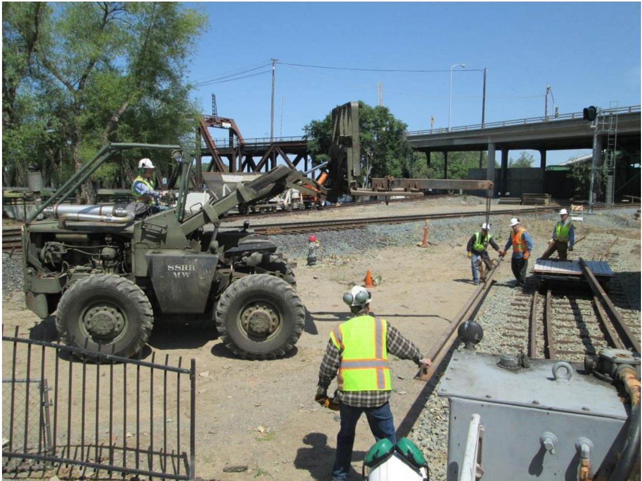
The team unloads the rails over at the Whisker Track work site