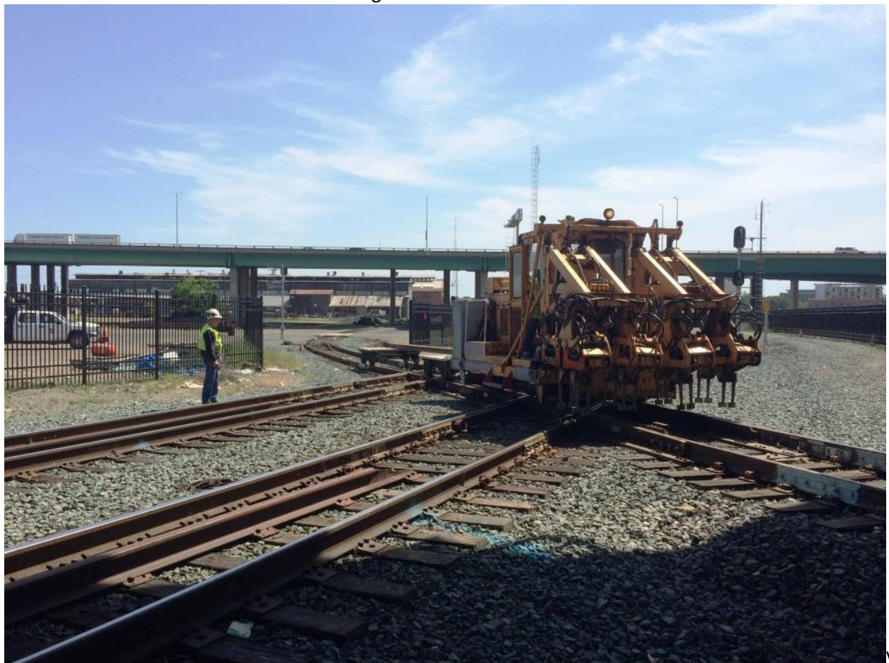
Conductor Ed watches Heather in the tamper cross the UP Main